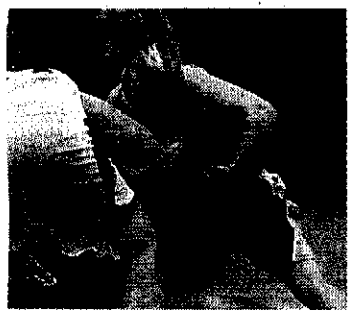
Boys and girls knock off pair knocked Bozeman teams /1S